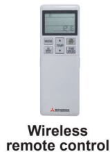
Wireless remote control