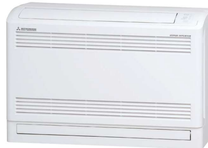
SRF25ZS-W, SRF35ZS-W, SRF50ZSX-W