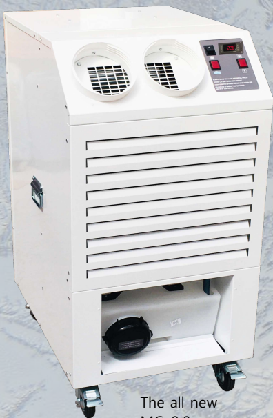
The all new MCE9.0

In addition to the environmental credentials the MCE9.0 delivers unrivalled performance. 9kW of cooling from a standard 13A supply and powerful backward curved fans that can exhaust warm air over 10m through of lightweight, standard 200mm ducting that's much easier to handle and store than some of the 300-400mm duct that's commonly used. Also featuring fully adjustable airflow, digital thermostatic control, auto shut off and indicator light when the condensate tank is full and lockable castors for easy manoeuvrability the MCE9.0 is probably the most powerful and versatile portable air conditioner on the market.