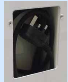
Recessed Cable Pocket